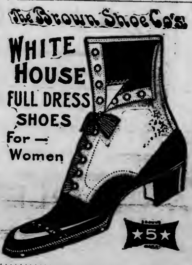
WHITE HOUSE FULL DRESS SHOES For Women